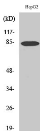
Western Blot analysis of various cells using DCAMKL2 Polyclonal Antibody